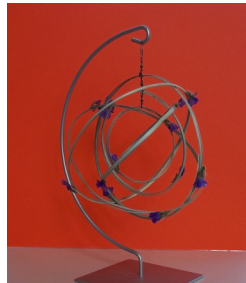
Below: Diane’s small design in the class “Neutrons”